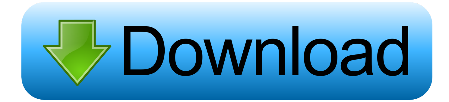
OpenVAS 7 Released – Open Source Vulnerability Scanner